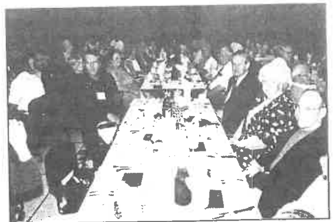
DFA family members enjoyed the Friday night banquet at Doane College.