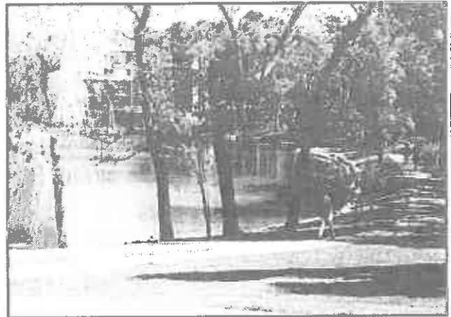
Newly renovated Doane Lake

Don't miss out on this exciting week at Doane College! There is still time to register for the 46 th biennial Doan(e) Family Association of America, Inc., reunion in Crete, Neb., on Doane College's beautiful campus, July 24-29. Since 1872, Doane has occupied a distinguished place among liberal arts colleges in the Midwest. Situated on 300 wooded acres, the campus has two ponds with swans and ducks, several bridges, and nature trails. Three buildings are listed in the National Register of Historic Places. Doane is the oldest liberal arts college in Nebraska, and has approximately 940 full-time students enrolled in Crete.