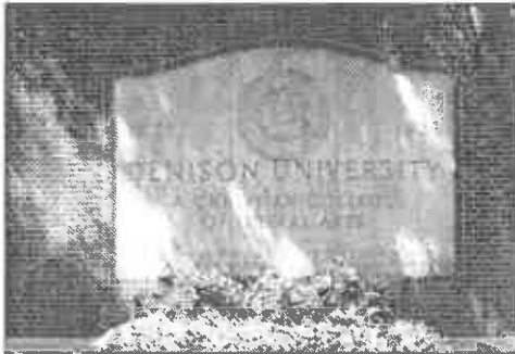
Denison University Main Entrance

Early in the afternoon, reunion committee members met to begin the final steps of registration and coordinate activities with the University staff. We were all pleased with the accommodations we would be using, and that they were fully air-conditioned. We were invited to be guests of the University for dinner that evening at the cafeteria and everyone renewed old acquaintances.