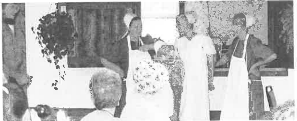
Three generations of an Amish family extended their hospitality