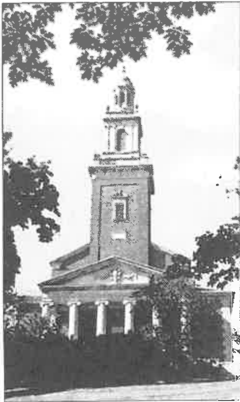
Swasey Chapel, Dennison University