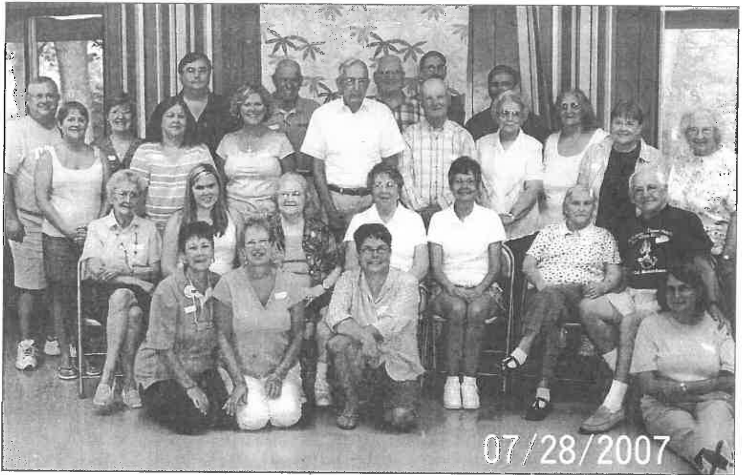
The Michigan/Great Lakes Chapter reunion in Williamston, Michigan.