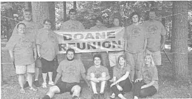
A 2016 group shot