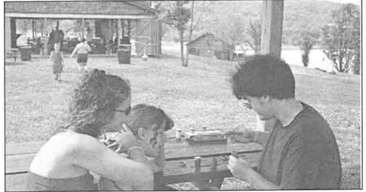
Face painting activity, 2006