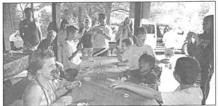
Kids' pie eating contest, 2010